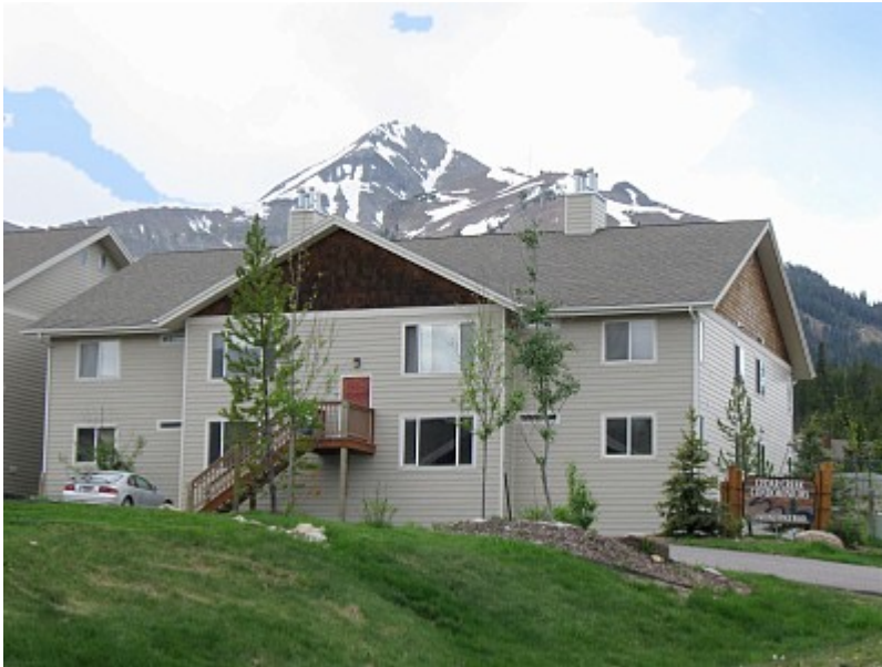
Lone Peak towers over Cedar Creek