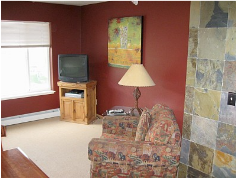
Comfortable Living Room