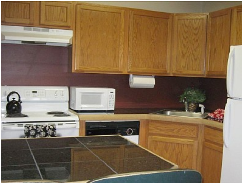
Newly Renovated, Fully Equipped Kitchen