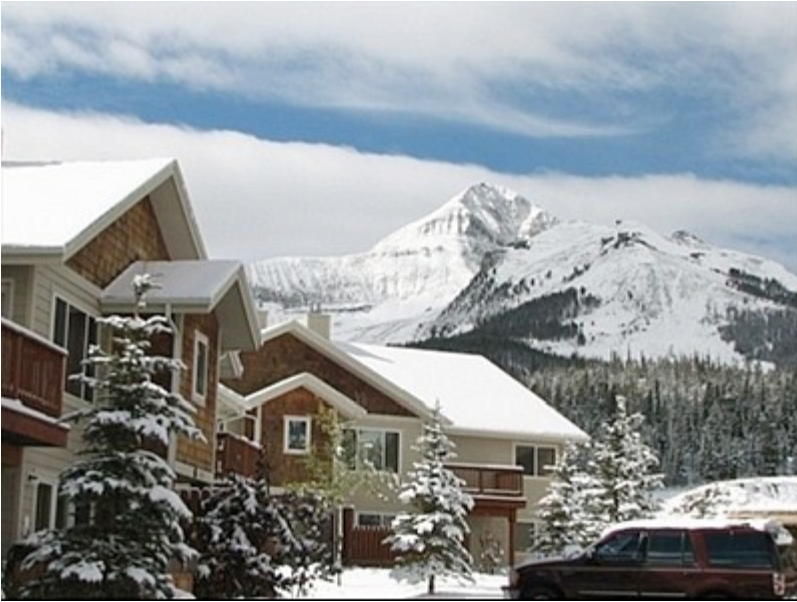
Lone Peak Towers Over Cedar Creek at Big Sky